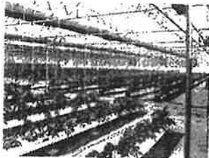
Nursery or Greenhouse (planting, potting, pruning, watering, harvesting, etc.)