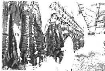
Processing & Packing (fruit, vegetables, chicken, eggs, pork, beef, lamb or other livestock, etc.)

Mark YES and CIRCLE all that apply even if the work was only for a short period of time. YES NO