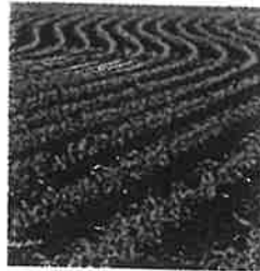
Agriculture or Field Work (planting, picking, sorting crops, soil preparation, irrigation, fumigation, etc.)