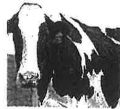
Dairy & Cattle Raising (feeding, milking, rounding up, etc.)