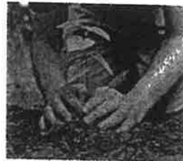
Forestry (soil preparation, planting, growing, cutting trees, etc.)